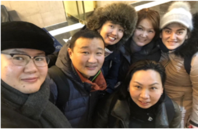
Mongolia team reunion